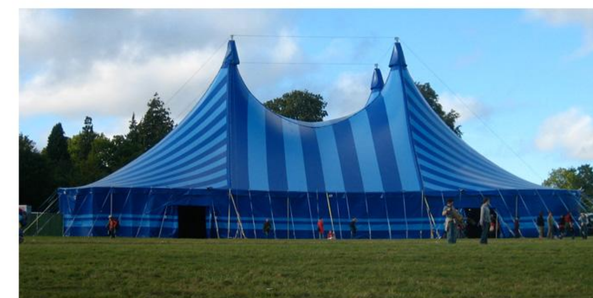
Image "Big blue tent" by Flickr user adactio, licensed via Creative Commons (CC-BY)