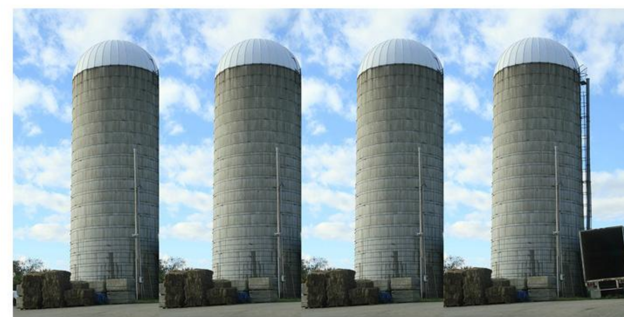
Image "silos" by Flickr user dsearls, licensed via Creative Commons (CC-BY)